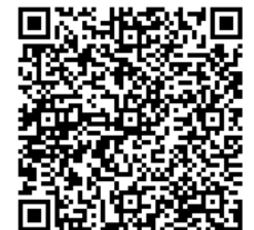
Visitor QR Code