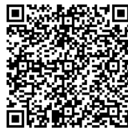
Commitment Card QR Code