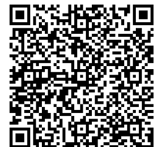
Visitor QR Code