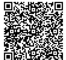
Visitor QR Code